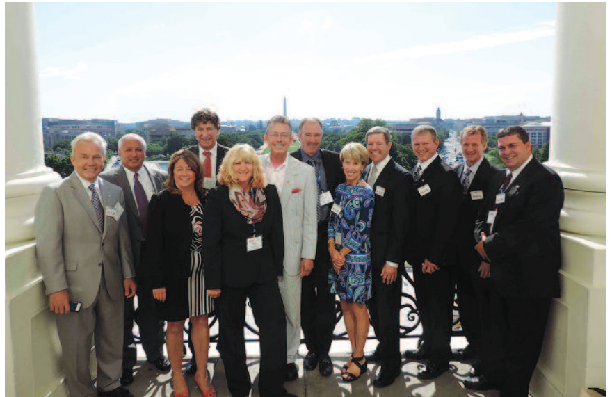
Members of AICC, FBA and PIA gathered on the balcony outside the office of U.S. Speaker of the House Paul Ryan after a meeting with him during the 12th Annual Industry Fly-In on June 7 in Washington, DC.

Politically-minded members of the corrugated, folding carton and printing industries joined forces with the National Association of Manufacturers (NAM) on June 6-7 for the 2016 AICC/FBA Industry Fly-In in Washington, DC. The 12th annual event saw more than 40 delegates gathering for a full day of legislative briefings, informative and inspiring keynote speeches, private visits with Congressional leaders and/or their aides and finally, a meeting with U.S. Speaker of the House, Paul Ryan.